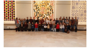
Students at the Newark Museum

The AP Literature, AP Language, and Senior Honors students took a trip to the Newark Museum on Wednesday, December 20. During this trip, they visited the historic Ballantine House, which was dressed up for a Victorian Christmas, the Tibetan Buddhist Altar, and numerous works of art. These exhibits connect to curricular studies, including Siddhartha, Jane Eyre, and A Doll's House.