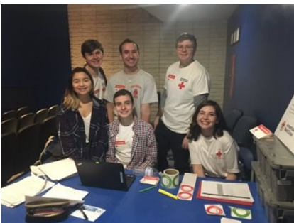
Red Cross Club Members

Were on the web! Visit us at www.jefftwp.org , follow us on Twitter @jthsfalcons, & like us on Facebook